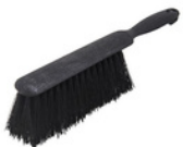
HILCSM3625803 8" Black 12/cs