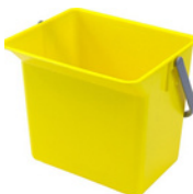
HIL20015 1.5 Gal. Yellow ea