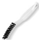
HILCSM36535103 8" White 24/cs

For dusting up sawdust, glass particles and everything in between. BPA free. Polypropylene bristles are long lasting. Polypropylene block for added durability. 2 1/2" trim.