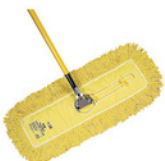
DFM24G 5" x 12" Green/Green 12/cs

Untreated, microfiber disposable cloth that leaves no slippery, sticky residue. Ideal for dusting floors before & after burnishing or prior to recoating. Size: 7" x 13.8" x 287.5' roll. White. Pack: 250 piece/roll; 1 roll per case.