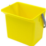
HIL20015 1.5 Gal. Yellow ea