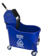
HIL20036 35 Qt. Blue ea