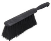
HILCSM3625803 8" Black 12/cs