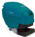
TE1510 CleaningPath:19in/ 482 mm